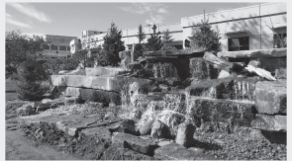
View of the waterfall garden from Kansas Ave.