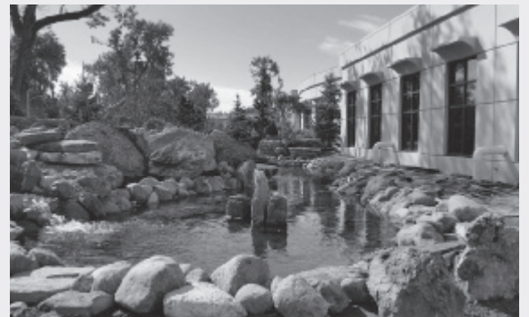
View of three waterfalls visible from new chemotherapy/infusion rooms added to the Morrison Cancer Center in 2017.